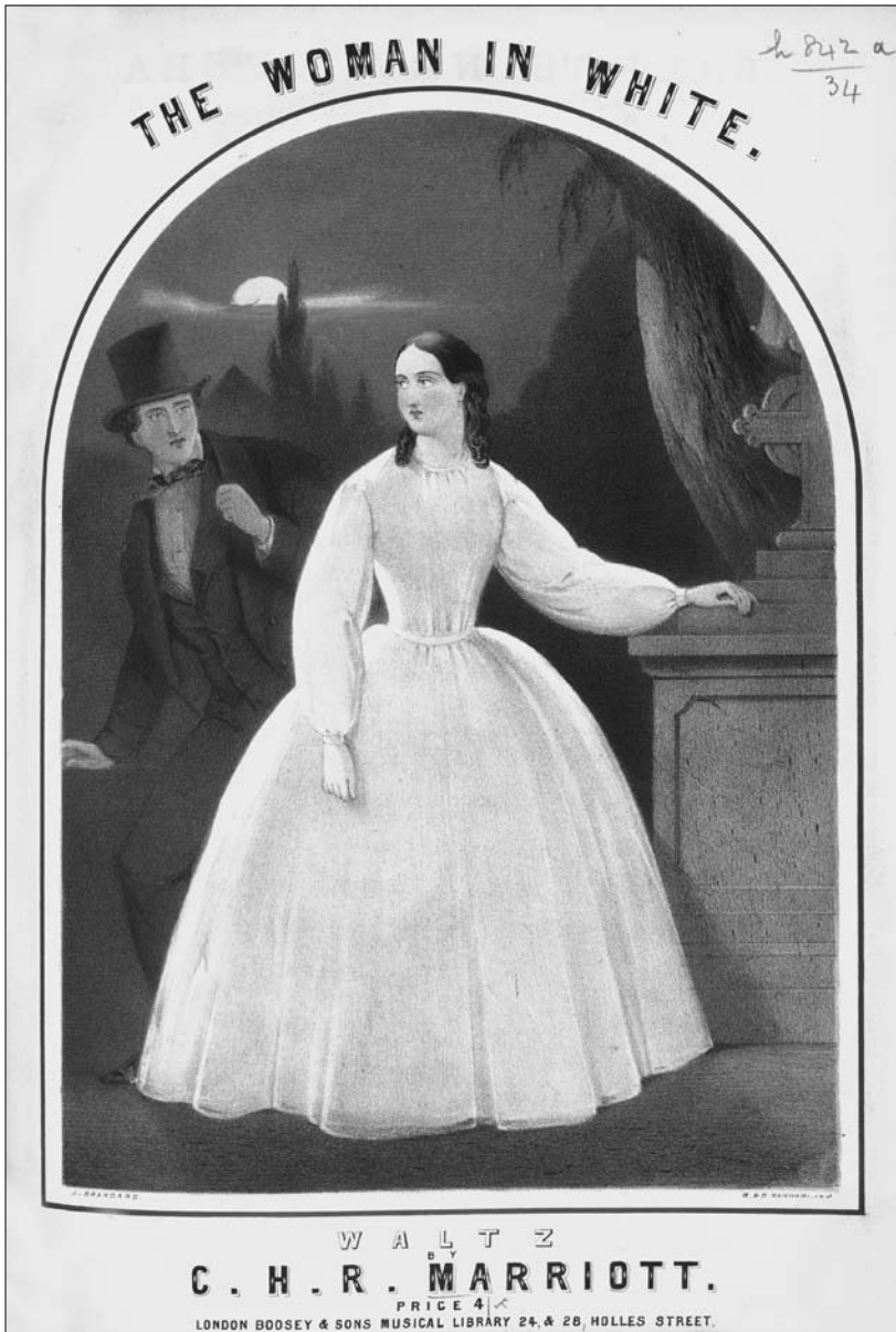
Fig. 2. The Woman in White Waltz, by C. H. R. Marriott, lithograph cover of sheet music. London: Boosey & Sons Musical Library, [1861]. The British Library, London. © British Library Board. All Rights Reserved. h.842.a.(34).

The Woman in White , which included toiletries, bonnets, songs, even a quadrille (fig. 2). In fact, one strand of argument here will be to question whether the physiological effects of sensation can ever truly be