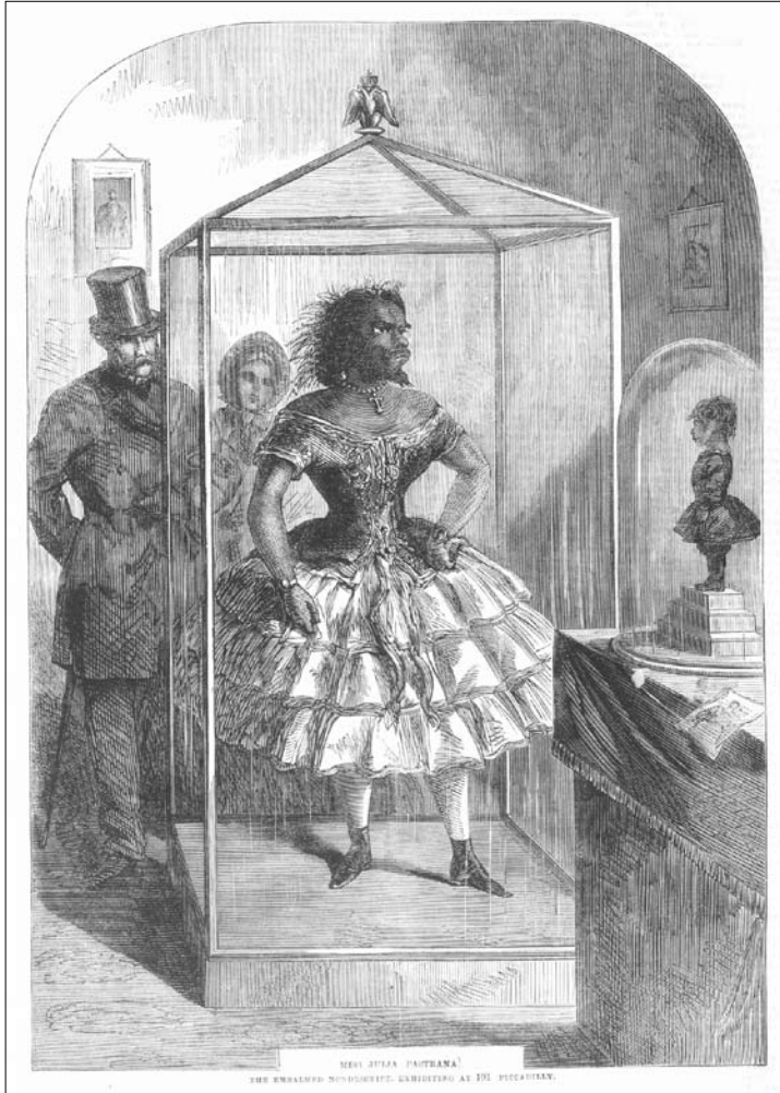
Fig. 5. “Miss Julia Pastrana, the Embalmed Nondescript,” Penny Illustrated Paper 21 (1 Mar. 1862): 136. Bodleian Library, University of Oxford; John Johnson Collection; Human Freaks 3(7).

embalmed corpse was displayed in a glass case in London during the summer of 1862. That this grotesque spectacle was advertised alongside art shows at highbrow galleries—and indeed, appeared on view at the Burlington Gallery in Piccadilly, just a few streets away from London’s most fashionable art venues—captures the mixed, heterogeneous nature of the city’s culture of display. An image of Pastrana’s mummy in the Penny Illustrated Paper illustrates the ways that this grisly scene was made respectable for middle-class viewers (fig. 5). The picture also reveals some of the surprising ways that Pastrana’s exhibition defied the usual Victorian