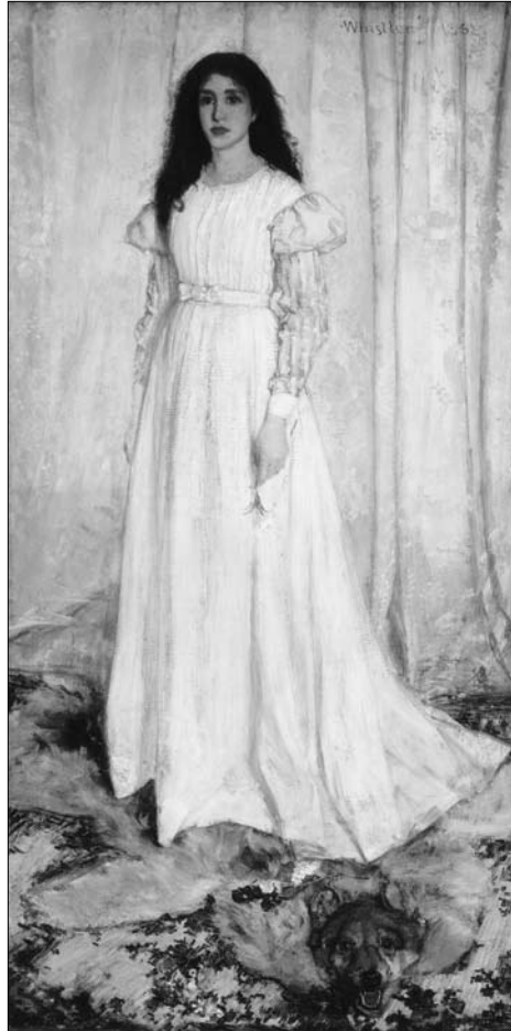
Fig. 1. James McNeill Whistler, The White Girl (Symphony in White, No. 1) , 1862, oil on canvas. National Gallery of Art, Washington, DC.

MacDonald 76-78; Weintraub 465-68). Under the radical aesthetic mantra, artworks were to have no didactic or useful message, but were to exist only as beautiful objects for their own sake. In The White Girl , a woman wearing a white muslin dress stands poised before a thickly draped white curtain (fig. 1). Playing with different shades and textures of white, the painting might be seen to perform what Nicholas Daly has called a “bravura minimalism” (2). White is the perfect color for modernist experimentation, signifying in and of itself the kind of aesthetic indeterminacy associated with modern art. Whistler’s painterly experiment might be placed in a modernist teleology of white abstraction that extends to Kazimir Malevich’s Suprematist Composition: White on