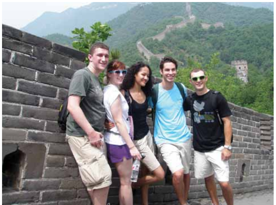
Vanderbilt students at the Mutianyu, Great Wall, People's Republic of China.