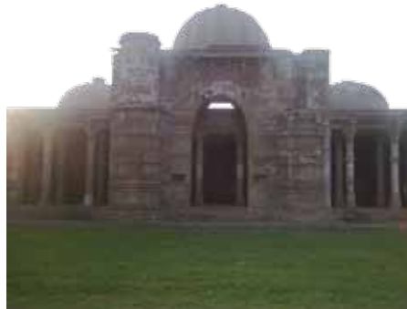
Surviving mosque from the fifteenth-century capital of Gujarat, Champaner, India. (opposite page) Takoro Gorge, east of Taiwan.