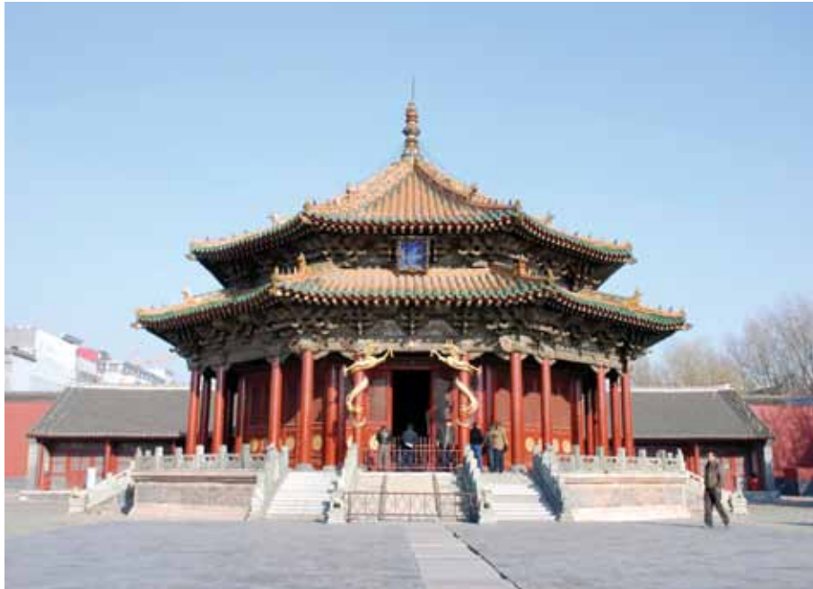
Dazheng Hall, imperial palace at Shenyang, seventeenth century, Liaoning Province, People's Republic of China.

dropped her pre-med status in favor of an Asian studies degree in Japanese language and culture.